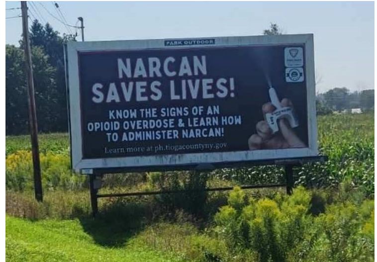
Billboard Design, Various locations, September 2024