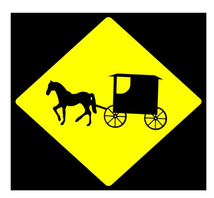
PaPhoto via <a href="https://www.goodfreephotos.com/">Good Free Photos</a>

Please RSVP to confirm your attendance to Miranda lmer at <a href="mailto:Palmerm@co.tioga.ny.us">Palmerm@co.tioga.ny.us</a> or 607-687-3553.