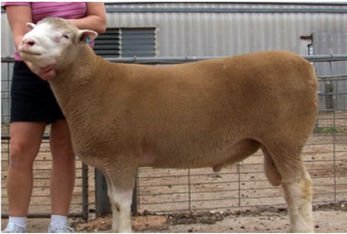
Rams should be examined prior to breeding season to insure there are no lost opportunities due to poor performance.

Good shepherds should be focused on good management practices, high performance sheep and meeting the needs of customers.