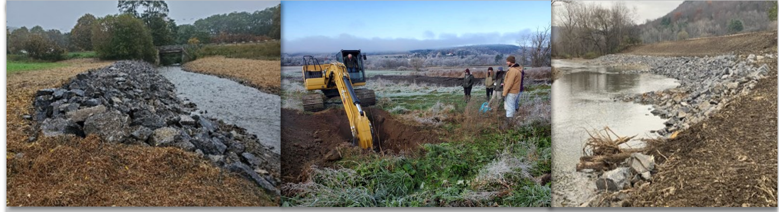
Streambank Protection Project in Otsego County (above)

Geologic Investigation for a Manure Storage Project in Otsego County (above)