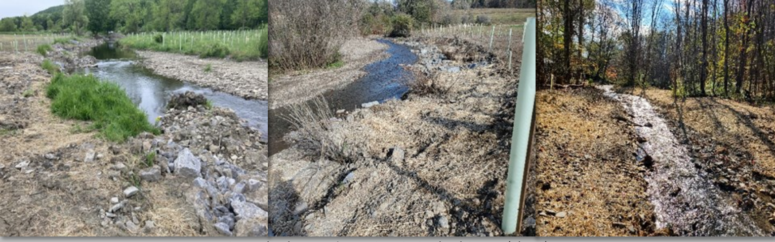
Streambank Protection Projects in Cortland County (above)

In partnership with other Districts in the Upper Susquehanna region, staff provided engineering support to various projects in 2021. The photos below show some of the implemented projects.