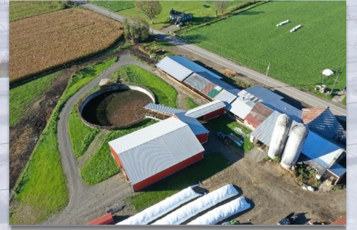
Covered barnyard in Candor

wintering areas as well. New hitensile fence was also constructed on the farm. This allowed for livestock exclusion from water courses and ponds on the property.