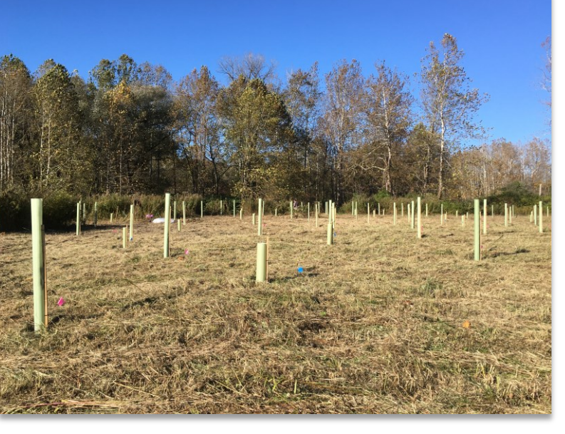
Landowner helping replant his buffer (above) Completed buffer planting along Owego Creek (below)

invasive species pressure or other issues impacting the buffer. The interns were also able to assist with stream surveys, work days to maintenance large buffers in partner counties and assist Broome County with monitoring their buffers.