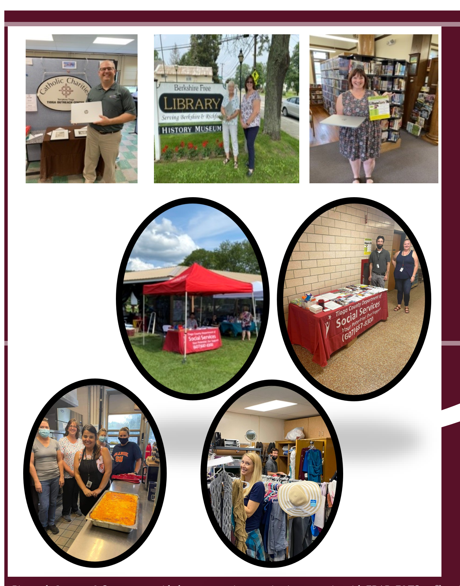
Pictured: Laptops & Scanners provided to community organizations to assist with ERAP; E&TS staff on the road to promote our programs and assist our community.